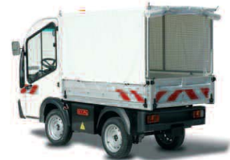
Canvas on cage