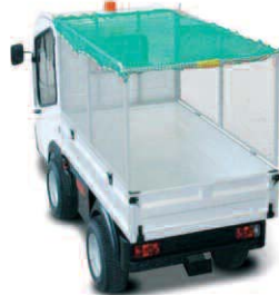
Net above cage