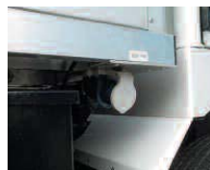
The chiller only runs if the vehicle is stopped and plugged in on 230V sector