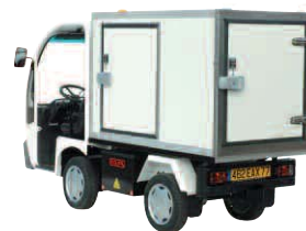
Double opening door

Stainless steel shelves : double floor with 6 foldaway shelves