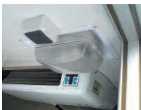
evaporator VO90 on mains 230-16A