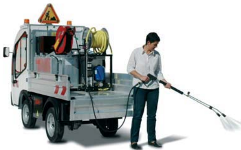
Electric watering system combined to high pressur cleaner 400l