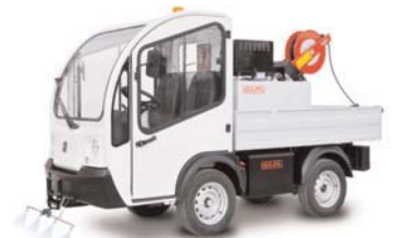
Front spray boom*