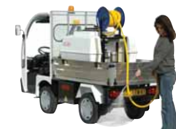
Watering and spraying