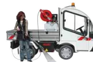
High pressure cleaner