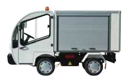
Van with shutter