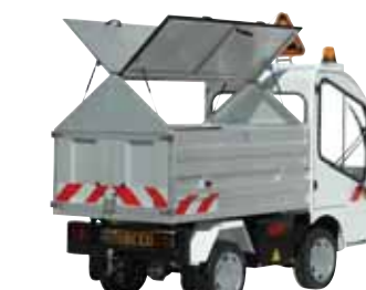
Tipper with lambo doors