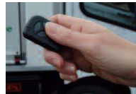
Remote central locking