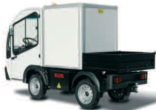
Combined deck / box van