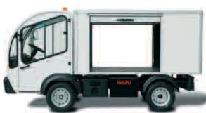
2nd lateral shutter