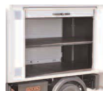
Mid height shelf