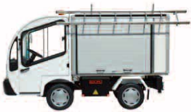
Side ladder carrier