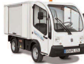
Wide box van 1,25m cargo area width